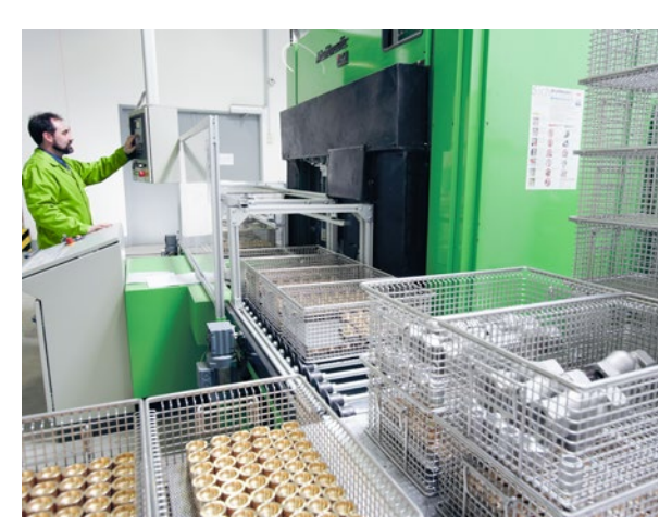
Free of oil and grease